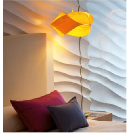
Catalogue Pg. 50-55