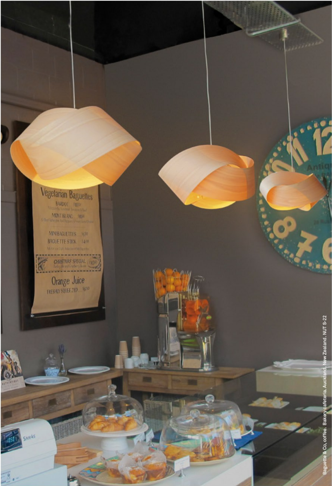
Baguette & Co. coffee. Bakery-cafeteria. Auckland, New Zealand. NUT S-22