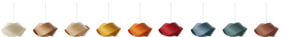
20 Ivory White